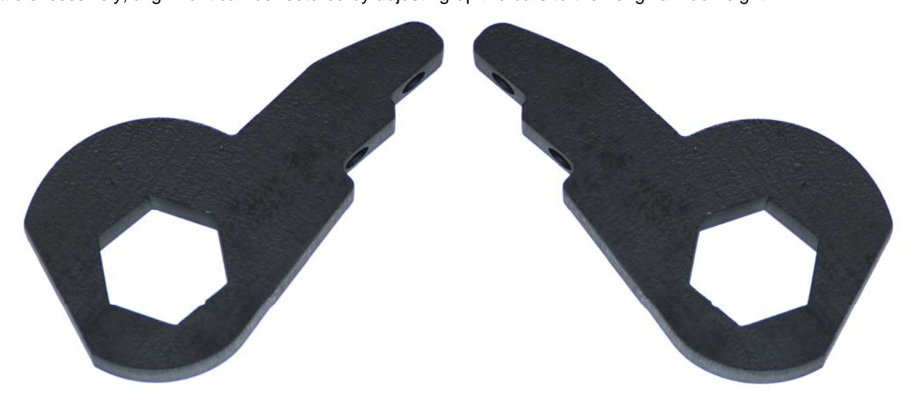
Thank You for choosing Rough Country for your suspension needs.

A front-end alignment should ALWAYS be checked after installing ANY vehicle suspension lift. This kit typically requires a slight toe-in adjustment. Record the ride height measurement at the time of alignment. If, in the future the torsion bars settle excessively, alignment can be restored by adjusting-up the bars to their original ride height.