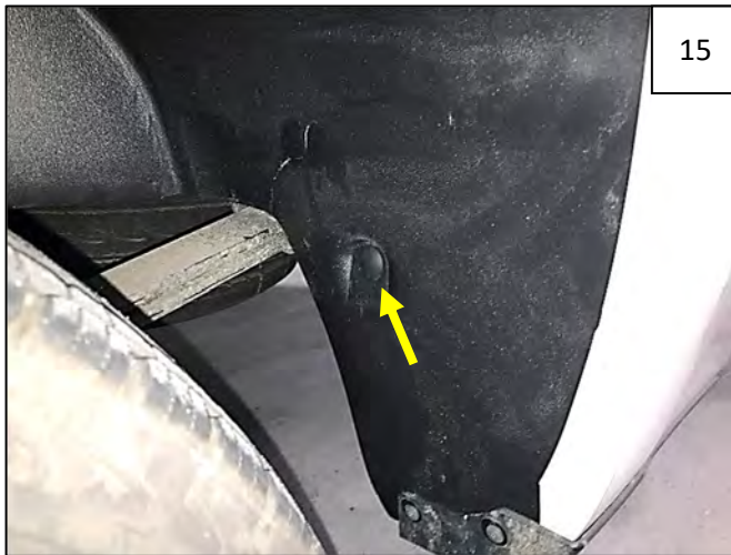
Install a supplied Plastic Retainer through rearward hole located midway up wheel well.