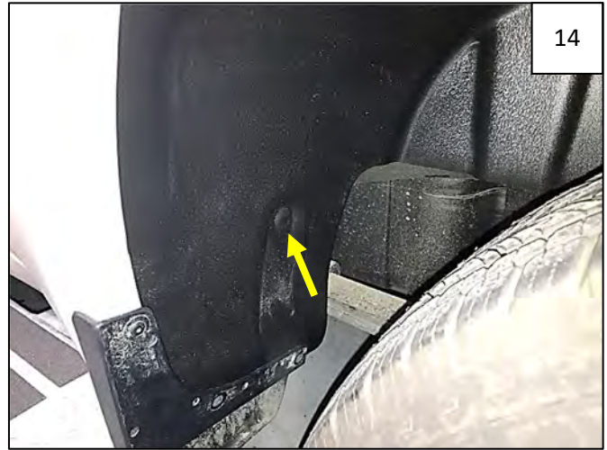
Install a supplied Plastic Retainer through forward hole located midway up wheel well.