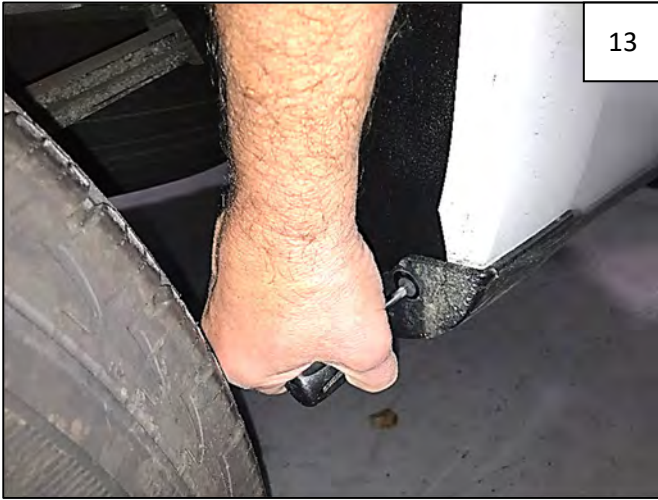
Start a supplied Truss Head Screw through outermost hole in mud guard and into clip in part. Tighten both screws.