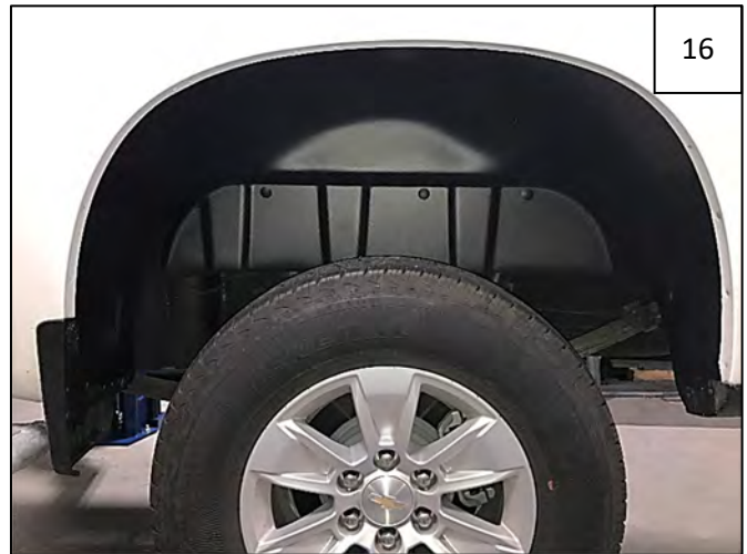
Installation is complete. Repeat for other side.