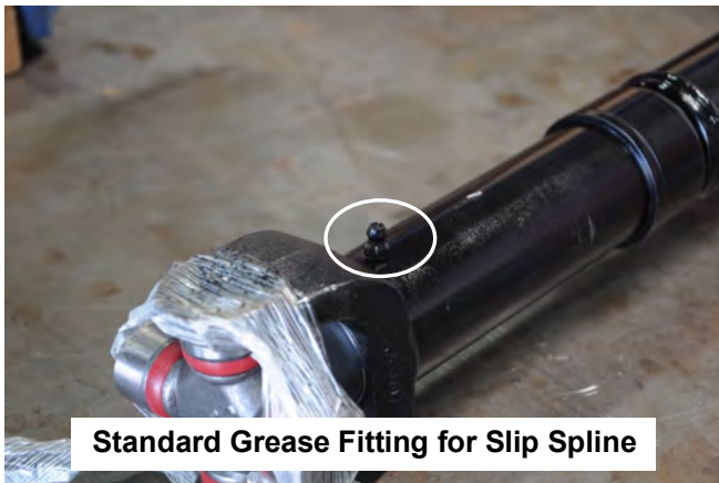
Standard Grease Fitting for Slip Spline