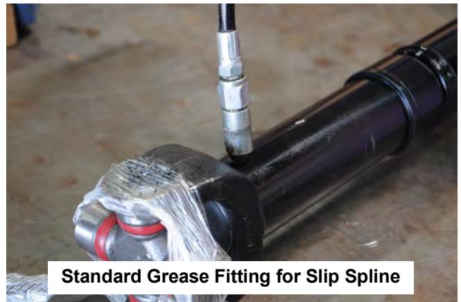
Standard Grease Fitting for Slip Spline