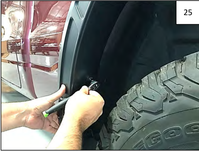
Apply pressure to flare towards vehicle body at each fastening point and tighten all fasteners.