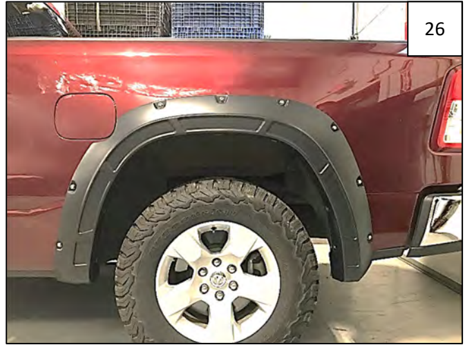
Complete Rear Flare Installation.