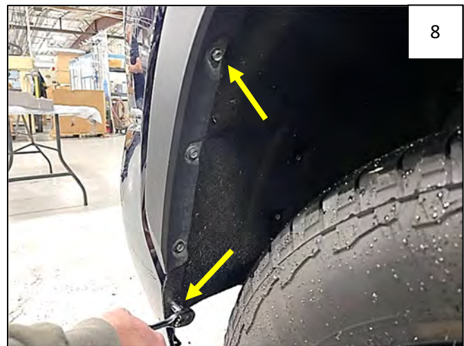
Using a 10mm socket, remove bottom and top bolt from front of wheel well as shown.