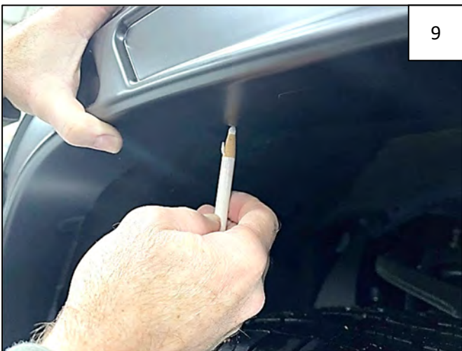
Hold flare firmly on fender and mark 2 top holes with a grease pencil.