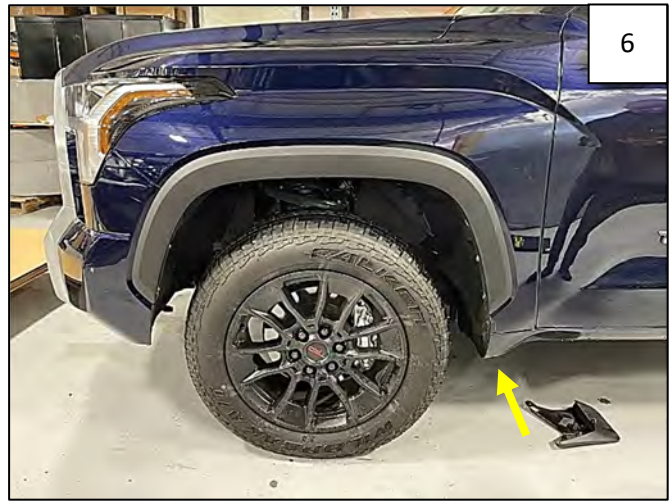
Using a 10mm socket, remove 1 factory fastener from underside of mud guard.