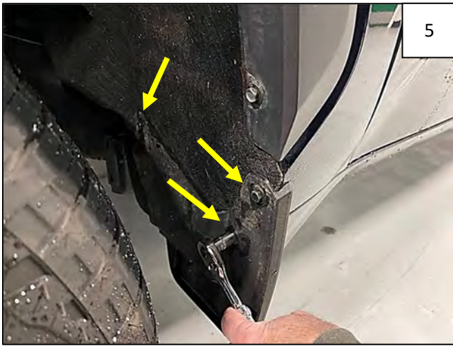
Using a 10mm socket, remove 3 factory fasteners from mud guard. Retain all screws for future use. NOTE: Some screws will not be used.