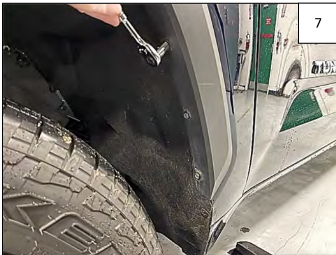
Using a 10mm socket, remove top bolt on rear of rear wheel well as shown.