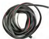
Wiper Style Edge Trim 336 inches