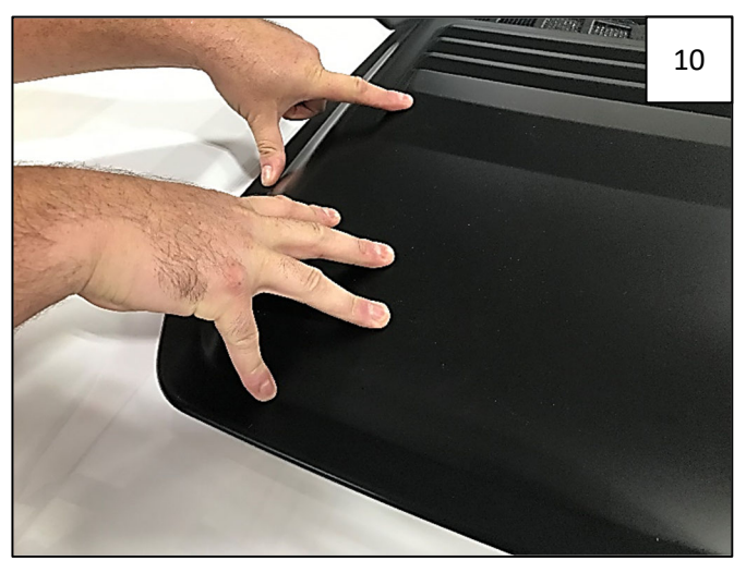
Press part against vehicle at areas of tape for 30 seconds to ensure full adhesion. Tape cures after 24 hours at 65 degrees.