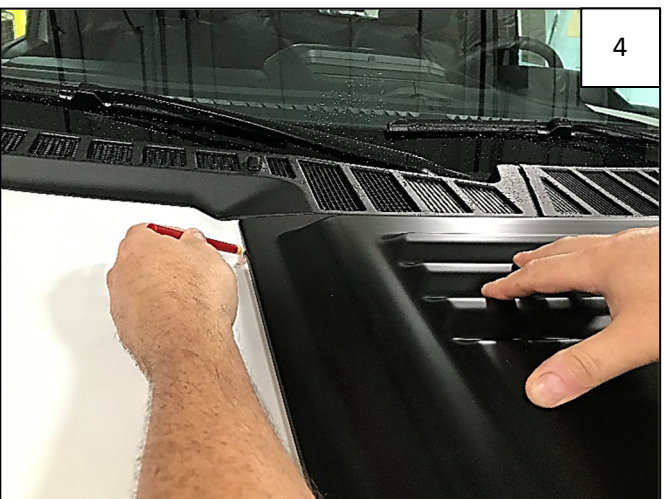
Mark along opposite rear corner of part. Remove part and check both marks to make sure they are evenly placed along hood feature. If placement is good, proceed to Step 5.