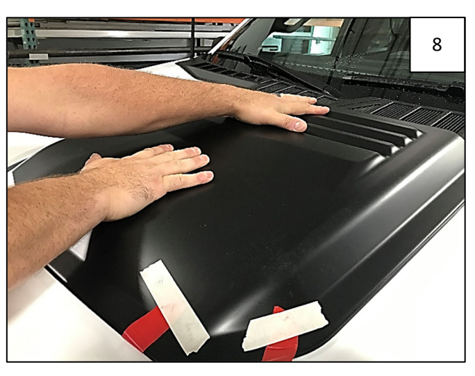
Lower part onto hood, maintaining position. Once the tape begins to contact the hood, adhesion is immediate. Press center of part to adhere four center tape pads.