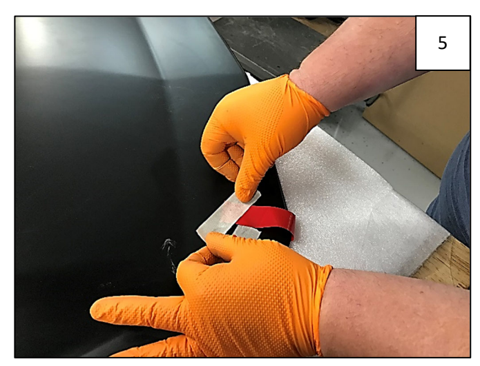
Peel 2-3 inches from each piece of tape around perimeter of part, at each end. Use masking tape to secure tape leaders to outside of part.