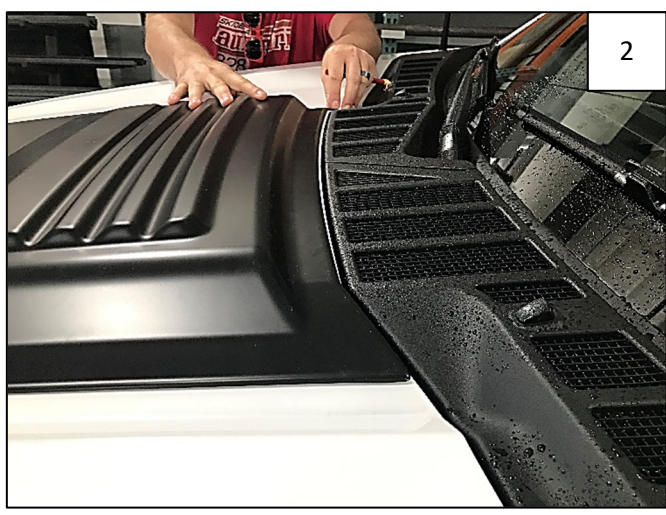
Before peeling any tape, place part carefully on hood, aligning rear edge of Hood Protector with the edge of the hood, about 1mm from rolled edge of hood.