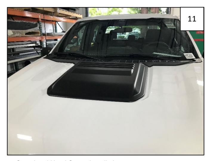
Completed Hood Scoop Installation.