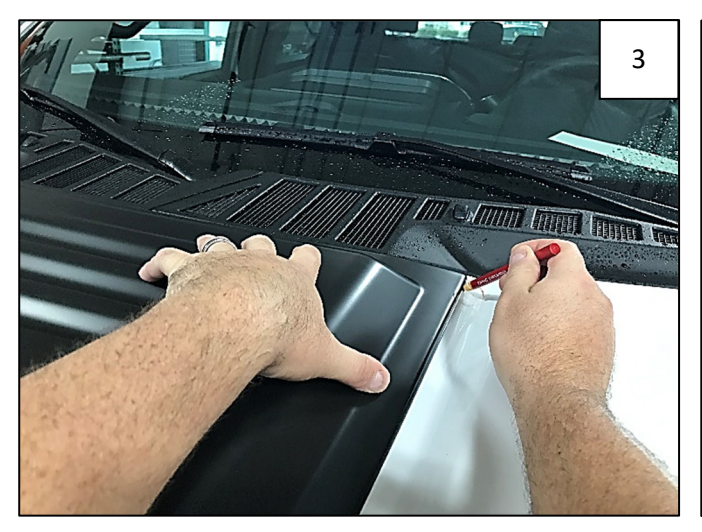
Using a grease pencil, mark hood at rear corner. You can also use masking tape to mark.