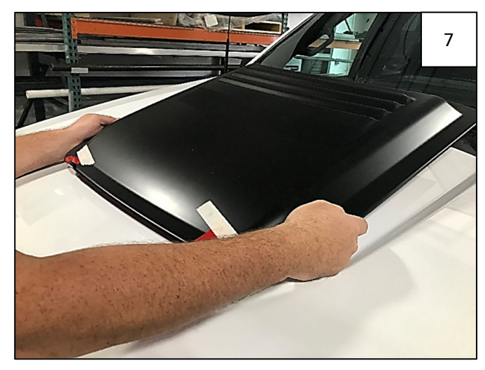
Replace part on hood, slowly and carefully aligning with rear of hood and with marks made in Steps 3-4. NOTE: Once the tape adheres, the part cannot be adjusted.