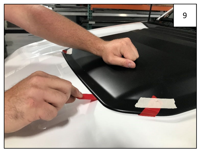
Begin pulling red tape leaders, discarding masking tape. Carefully pull each tape leader at a 45-degree angle away from part into interior of vehicle to release from the tape, pressing against part as you go.