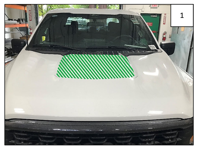
Vehicle surface must be free of dust and dirt and dry. Use supplied alcohol wipe to clean hood at areas of tape. Alternately: Clean area with alcohol or degreaser.