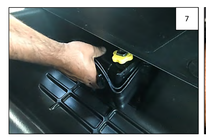
Reinstall jack onto jack plate.