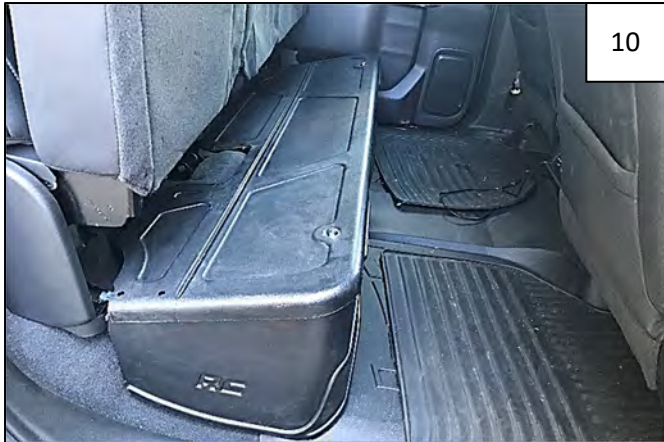
Underseat Storage Box installation is complete. Lower seat into place.