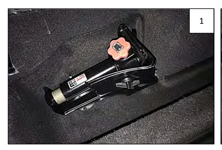
Locate the jack under the rear passenger seat.