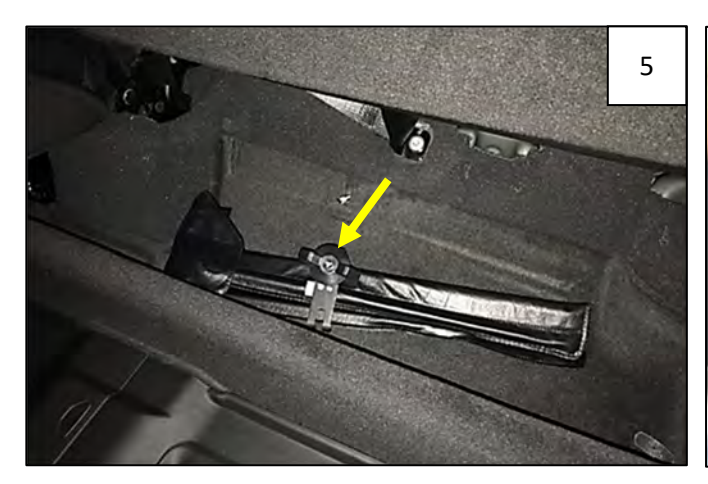
Loosen the wing nut from the floor stud and remove the tool kit from under the drivers side rear seat.