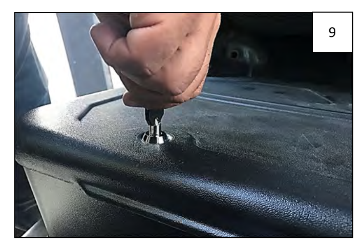
Close the lid of the UnderSeat Storage Box, and lock each lock with pair of keys.