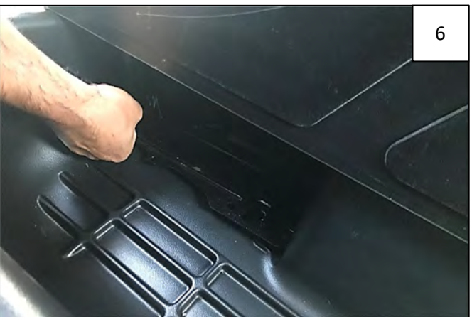
Place the Underseat Storage Box against the contours of the floor. Lid opens out into cab. Reinstall jack plate and nuts removed in Step 4.