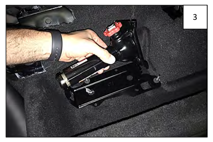
Loosen the jack and remove from the mount. Set aside.