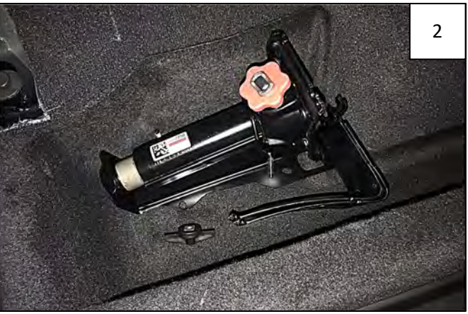
Remove the wing nut from the threaded hook and place the wheel chocks to the side.