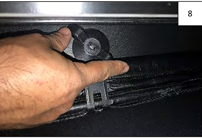
Nest jack tools in driver side of the Underseat Storage Box (against rear of box) and reinstall knob removed in Step 5.