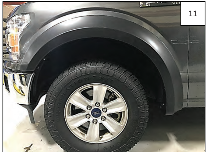
Still holding flare to fender, re-install remaining factory screws removed in Step 5 using 7/32" and 9/32" sockets. Using Phillips Screwdriver, install 1 #10 Truss Screw into Long "U" clip installed in Step 8.