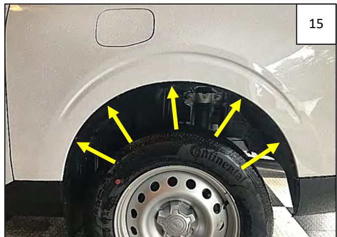
Using a pry tool, remove 5 plastic factory fasteners.