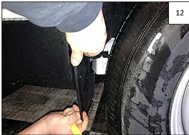
Remove and discard mud guard by disengaging 2 internal clips.