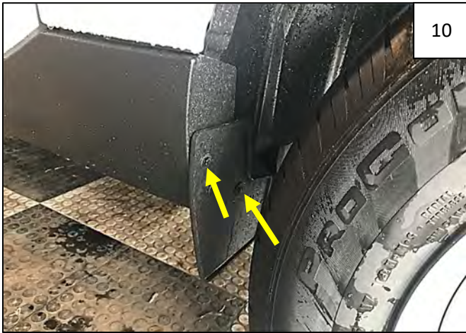
Using a 7mm socket, remove 2 factory bolts from front mud guard.

NOTE: If your vehicle is equipped with factory mud flaps, these must be removed prior to installation of flares. Any retaining clips left after mud flap removal should also be removed.