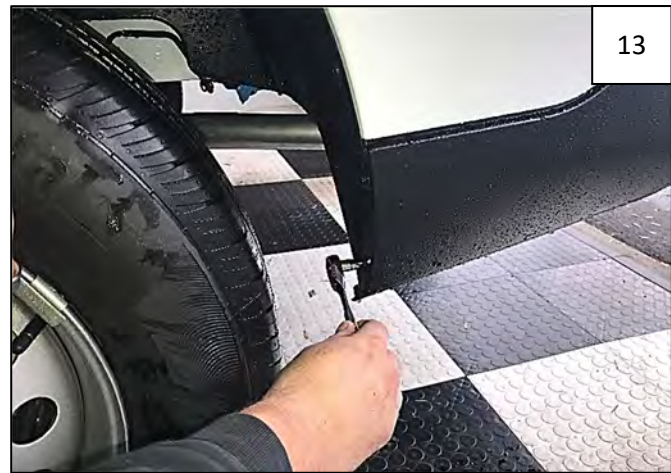
Using a 7mm socket, remove 1 factory bolt from lower rear of wheel well. Retain this bolt.