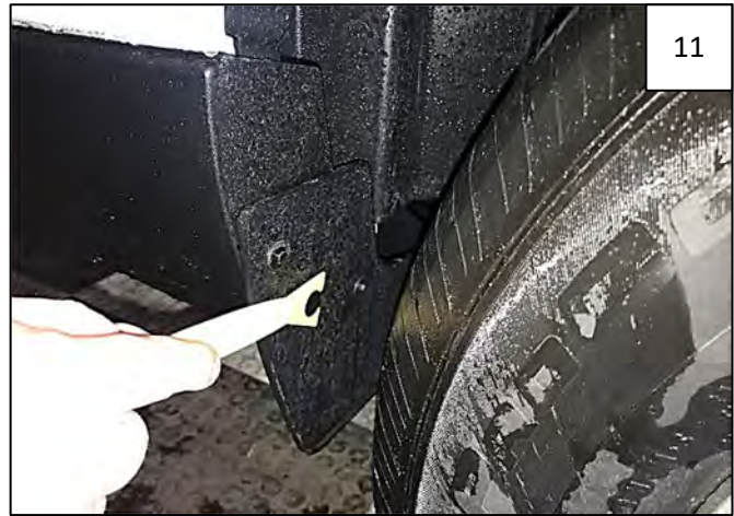
Using a pry tool, remove 1 factory plastic fastener from front mud guard.